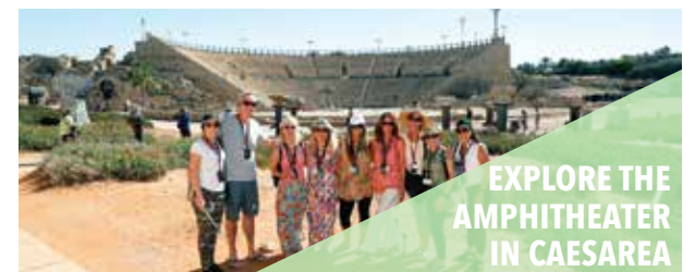
EXPLORE THE AMPHITHEATER IN CAESAREA