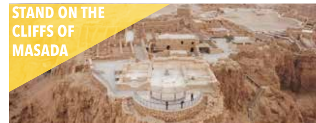
STAND ON THE CLIFFS OF MASADA