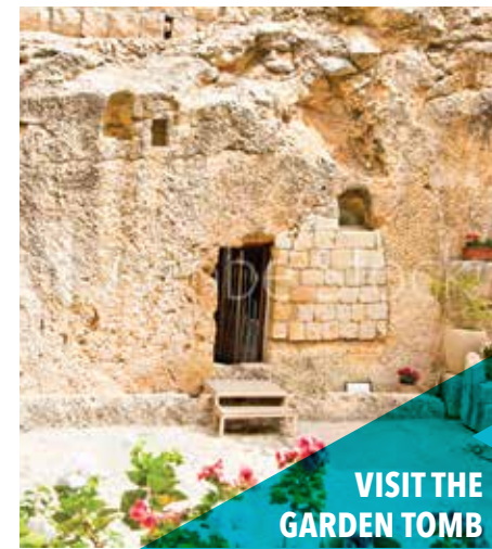
VISIT THE GARDEN TOMB

Meals: Buffet breakfast and hotel dinner daily in Israel plus three lunches